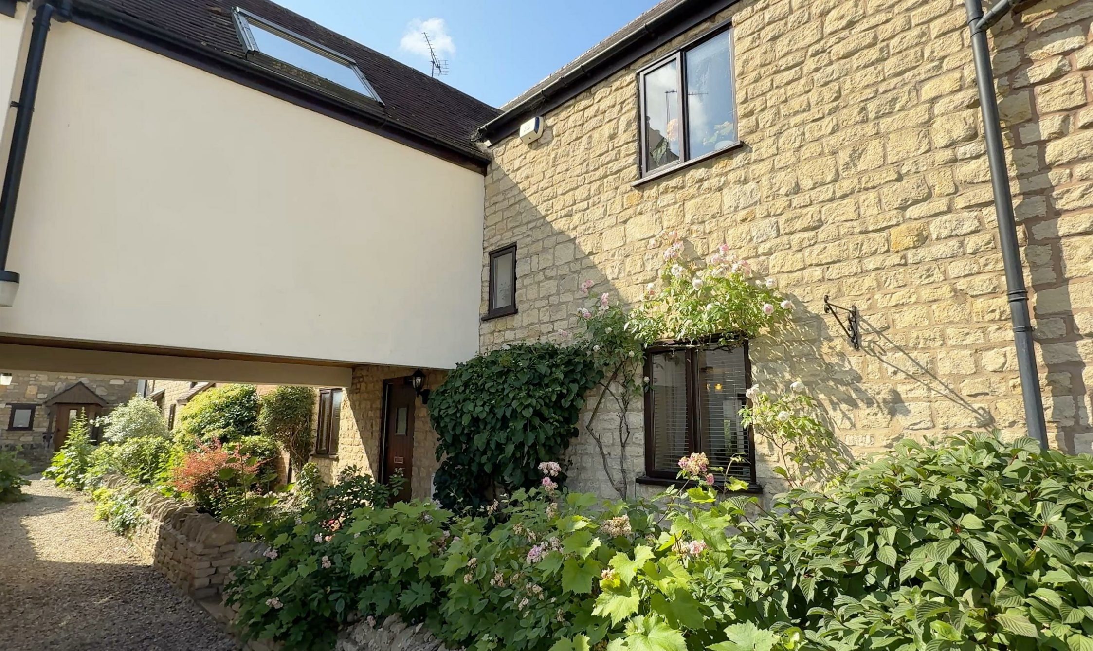
Greyrick Court , Mickleton , GL55 6TT